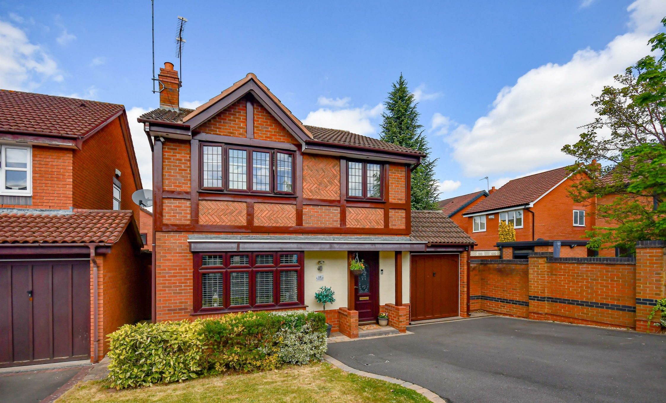
19 Penleigh Gardens, Wombourne, Wolverhampton, WV5 8EJ